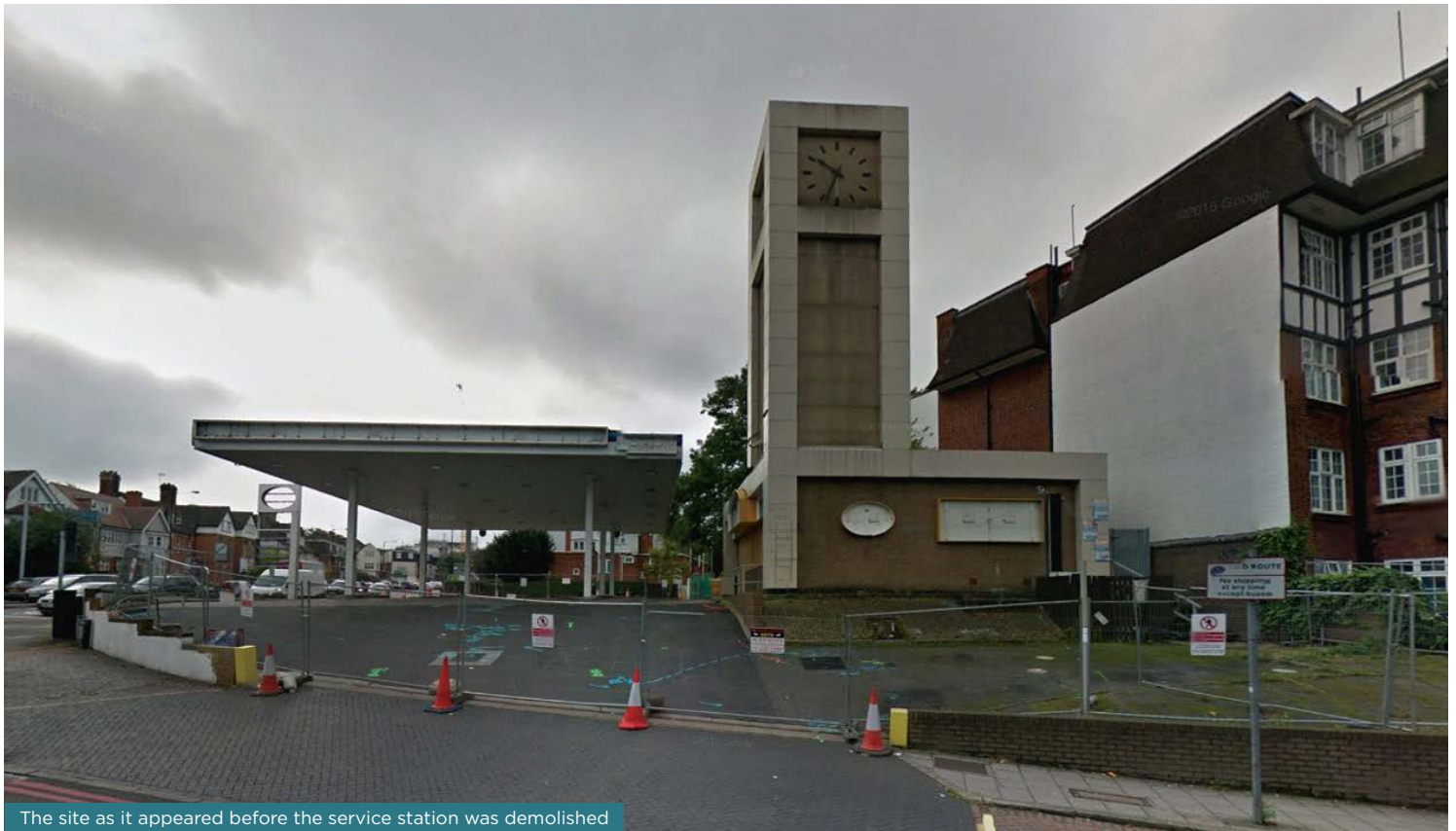
The site as it appeared before the service station was demolished