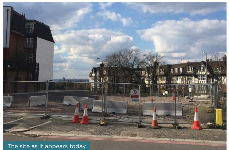
The site as it appears today